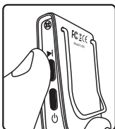
Sound Selection Button

The unit will continue to play sounds until you turn the unit off with the ON/OFF BUTTON.